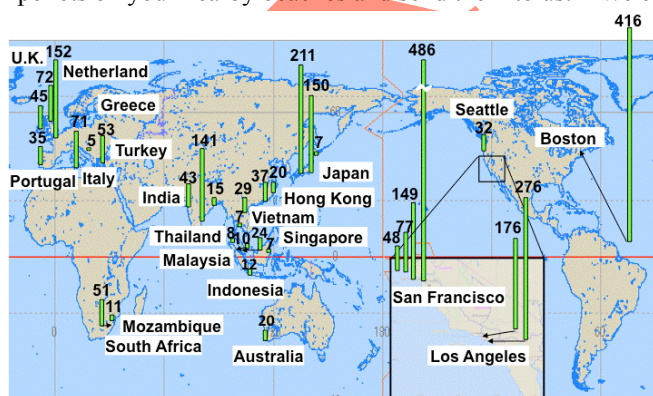
Figure 1. Concentration of PCBs* in beached plastic resin pellet (ng/g-pellet)

The present paper demonstrated the utility of International pellet watch. However, our spatial coverage is still very limited and of course the strength of the programme will be related to the coverage we can achieve. Please collect resin pellets on your nearby beaches and send them to us. We call for pellets.